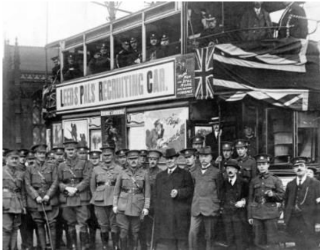
A recruiting bus in Leeds

In Bradford alone 2000 men joined the army by 1915 and would begin army training.