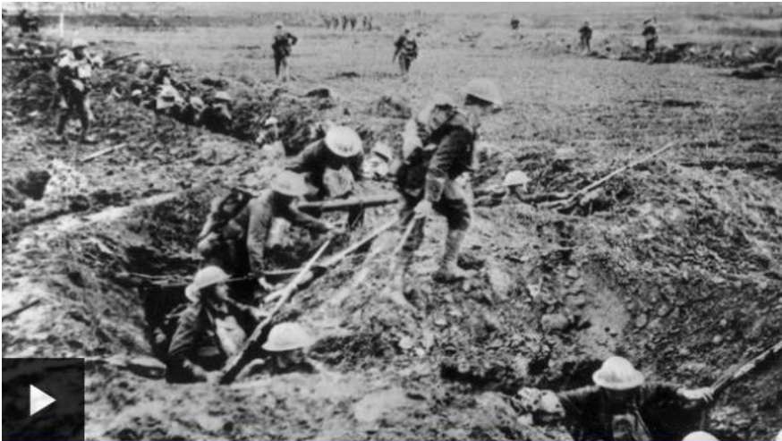
Ricky looks into the tactics used during WW1

Click the video to some of the reasons that fighting on the front was so dangerous.