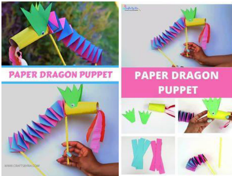
Chinese paper dragon - different strips of paper and lolly sticks or straws.